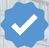
Verification of Benefits