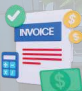
Medical Billing & Coding